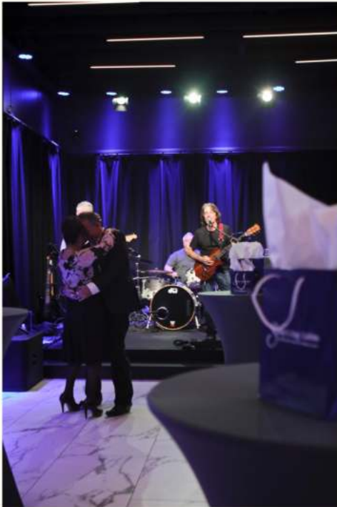
Dancing at a Sissy's Log Cabin Employee Appreciation Event